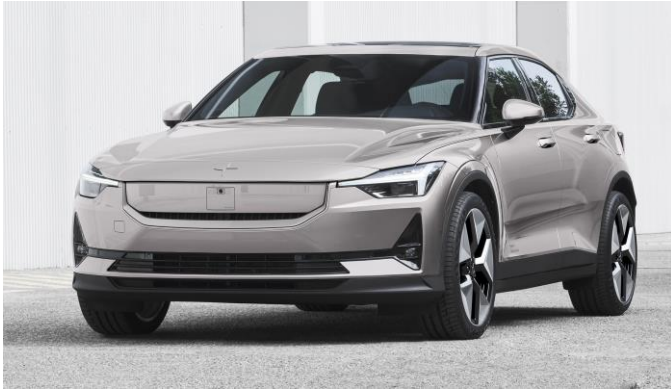
2024 update Polestar 2.