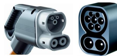
CCS2 charging plug and socket

The Model Y is fitted with a CCS2 socket allowing it to charge via all Type 2 AC chargers 2 , CCS2 DC fast-chargers AND the Tesla Supercharger network.