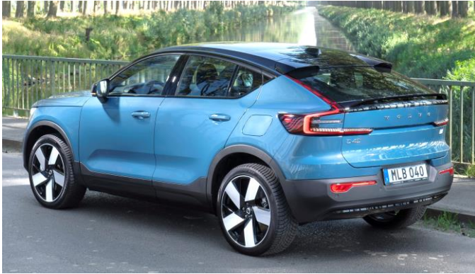
Volvo C40 Recharge.