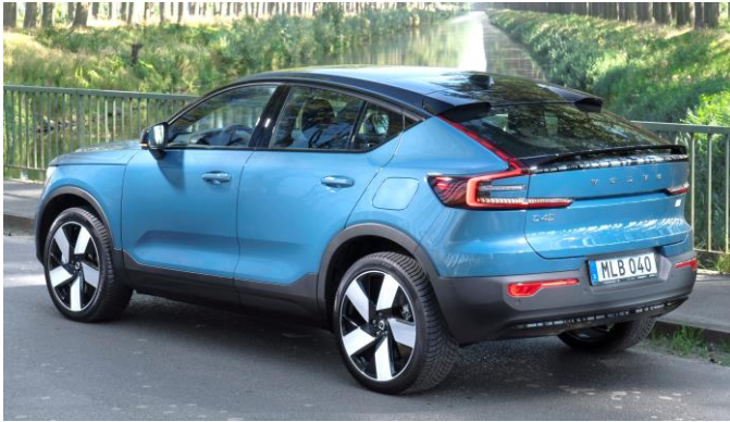
Volvo C40 Recharge.