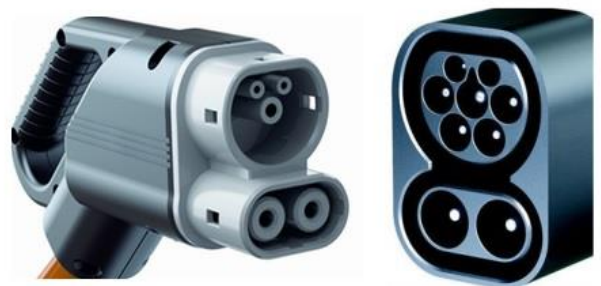
CCS2 charging plug and socket

The Volvo C40 Recharge is fitted with a CCS2 socket allowing it to charge via Type 2 AC chargers 2 as well as CCS2 DC fast-chargers.