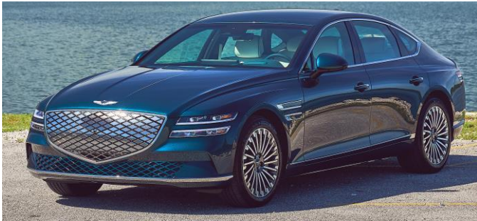
Genesis G80.