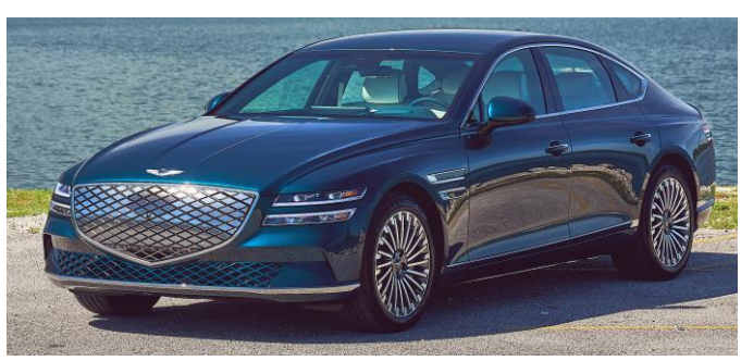
Genesis G80.