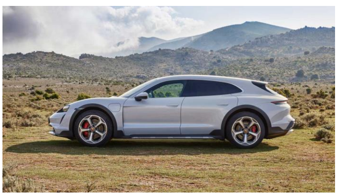
Porsche Taycan Cross Turismo.

Created and written by: Bryce Gaton Contact: Bryce@EVChoice.com.au