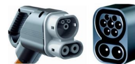
CCS2 charging plug and socket

The EQS is fitted with a CCS2 socket allowing it to charge via Type 2 AC chargers 2 as well as via CCS2 DC fast-chargers.