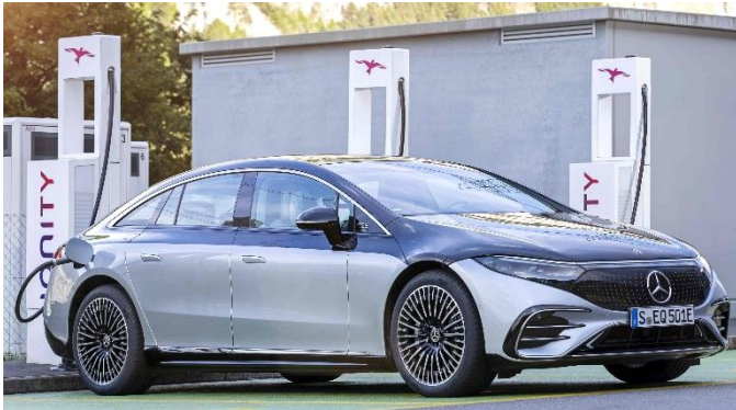
Mercedes EQS.