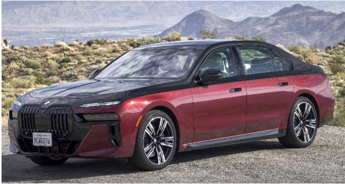
BMW i7.

Created and written by: Bryce Gatton Contact: Bryce@EVChoice.com.au