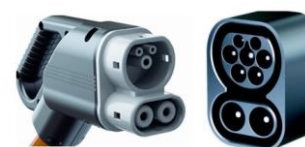
CCS2 charging plug and socket

The Kona electric is fitted with a CCS2 socket allowing it to charge via Type 2 AC chargers 2 as well as CCS2 DC fast-chargers.