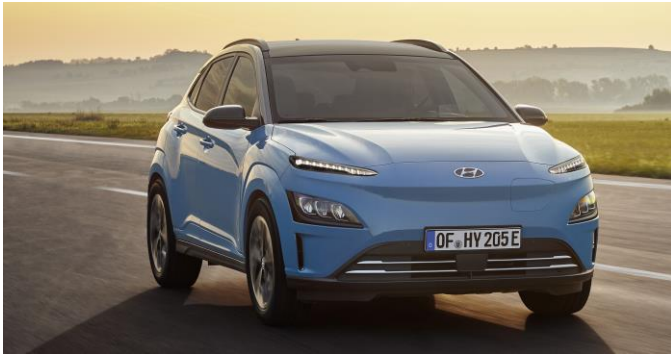
2021 Kona electric.