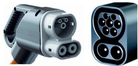
CCS2 charging plug and socket

The I-Pace is fitted with a CCS2 socket allowing it to charge via AC as well as via CCS2 DC fast-chargers.