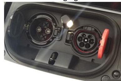
Nissan ZE1 Leaf charging ports (Type 2 AC on right, CHAdeMO DC on left)

The ZE1 Leaf is fitted with a Type 2 AC socket and a CHAdeMO socket for DC charging.