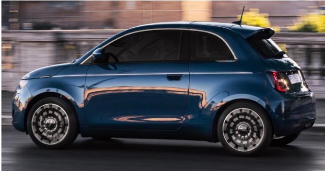
2023 Fiat 500e.