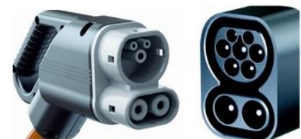
CCS2 charging plug and socket

The Peugeot e-2008 is fitted with a CCS2 socket allowing it to charge via Type 2 AC chargers 2 as well as CCS2 DC fast-chargers.