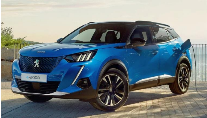
Peugeot e-2008