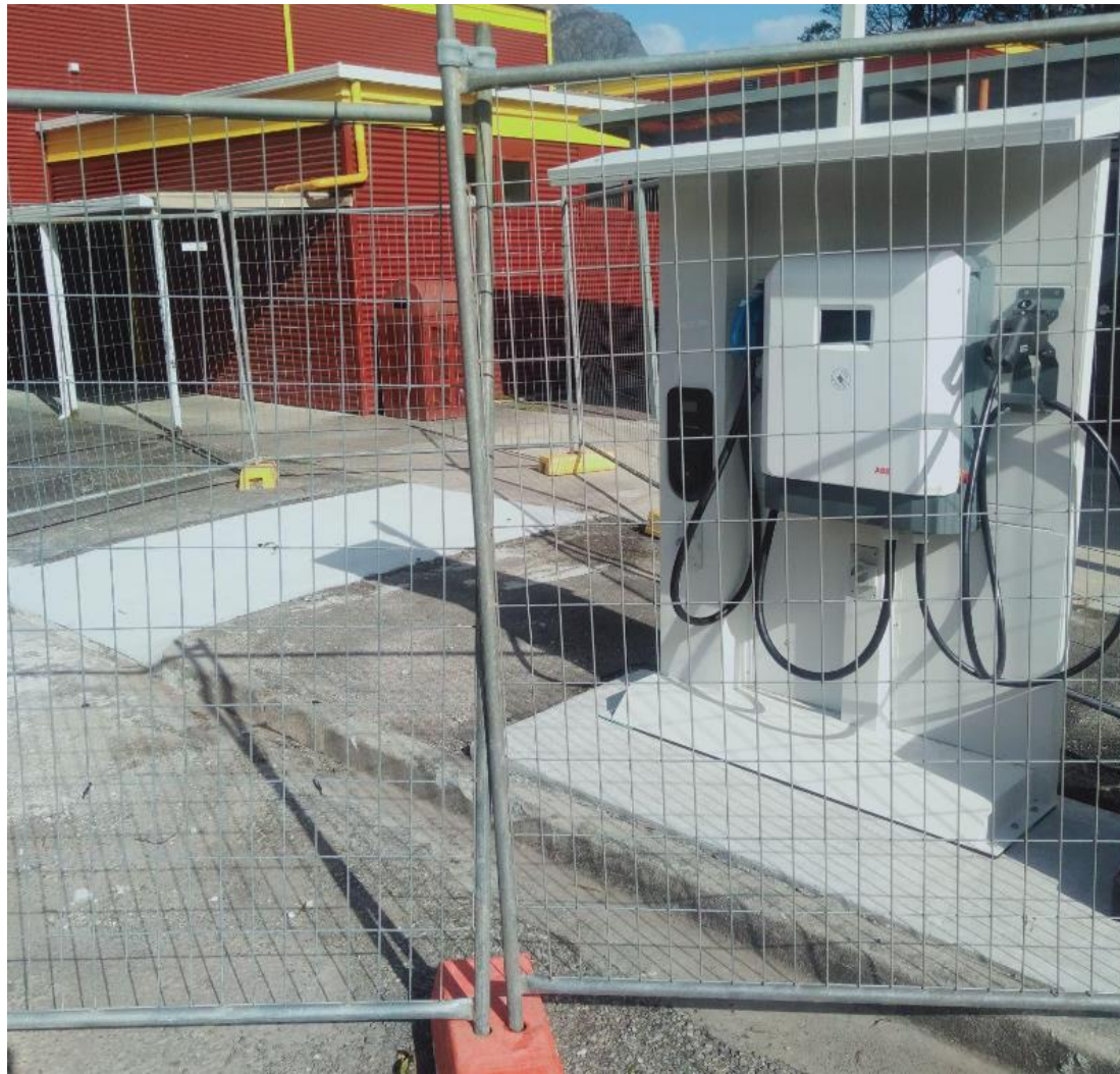
Tullah (EHT) – in build