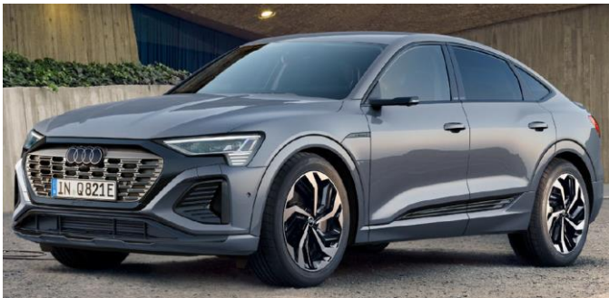
Audi Q8 e-tron sportsback.