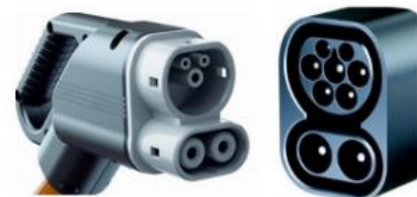
CCS2 charging plug and socket

The Audi Q8 e-tron is fitted with a CCS2 socket allowing it to charge using standard AC wall sockets or fixed chargers 2 (EVSEs), as well as CCS2 DC fast-chargers.