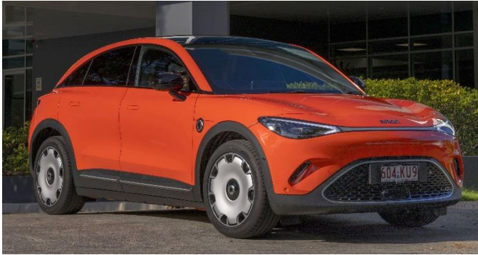
Smart #3.

Created and written by: Bryce Gatton Contact: Bryce@EVChoice.com.au